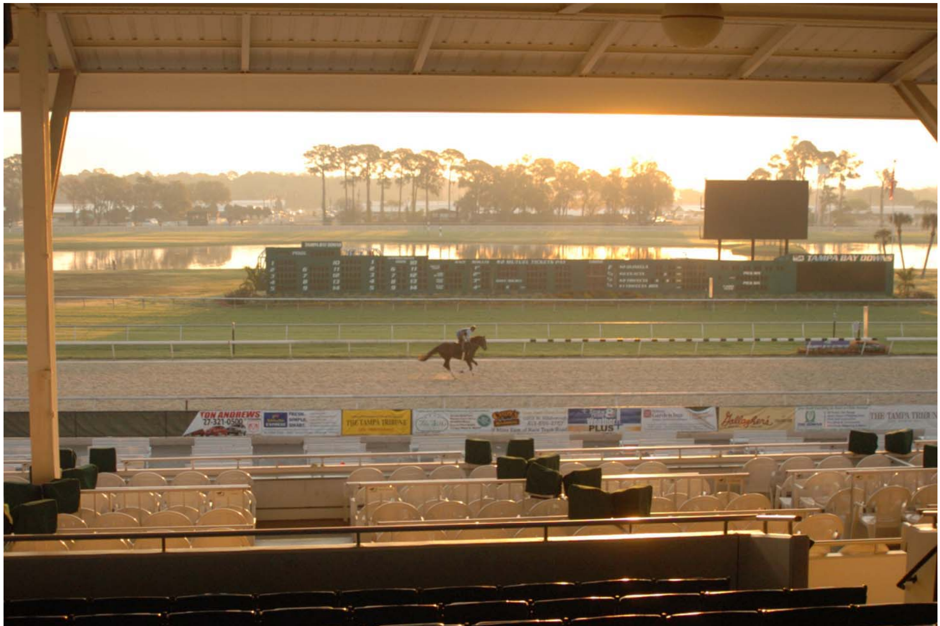
A horse gallops at sunrise over the Oldsmar oval.